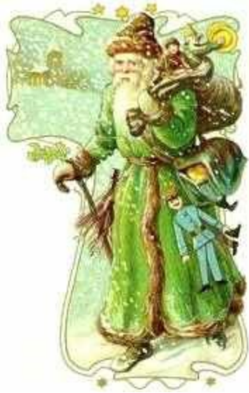
Before Coca Cola