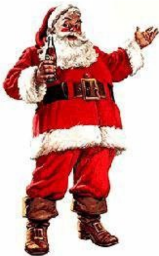
After Coca Cola